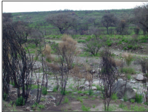
Regrowth at HC's Fire-Ravaged Ranch

resort El 44 in the Sierran Chaco at 1020 meters. HC called in a Spot-winged Falconet using tapes (I never knew you could do that with Falconets!) We stopped at HC's house to find Blue-Crowned Parakeets. Fire swept HC's ranch in August 2002 and it is just beginning to recover. Whether it was feeding the dogs or HC and JMB knowledge of the area we'll never know but we quickly found the Black-bodied Woodpecker at Pampa de Achala. Olive-crowned Crescent-chest and the endemic Córdoba Cinclodes were also hits. After a fine dinner of local fare and Argentine dance demonstrations, we spent the night in La Cumbre.