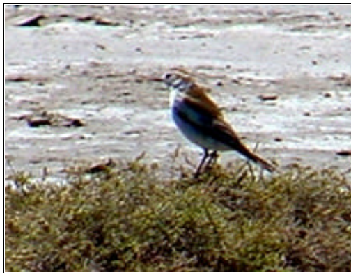
Female Salinas Monjita and her Nest

Day 7, Thursday 31 October After a careful drive onto a salt pan, we found a nest of the very local, endemic Salinas Monjitas. Later, backroad driving yielded several co-operative Chaco Owls and a most excellent Jaguarundi.