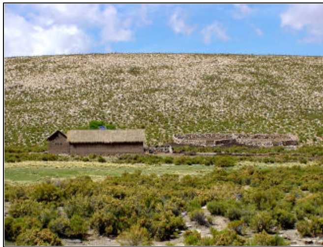
Una casa en medio de la nada

Day 17, Sunday 10 November We spent today in the highlands around Yavi. Northern Argentina reminds me of northern New Mexico. Remote, beautiful, dry, adobes, and solar panels. Andean Flamingo in a wet cow pasture and Puna Tinamou were highlights.