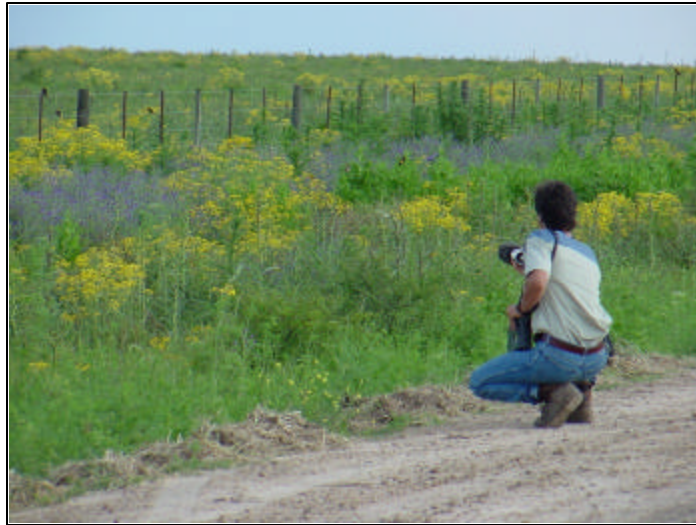
HC Taping Some of his Favorite Birds, SCBL

Day 4, Monday 28 October A long drive (with a nice stop for five Greater Rheas) brought us to the Area de Relleno Sanitario de San Francisco in the afternoon. (Doesn't that sound nicer than land fill?) Got a White-winged Black-Tyrant but missed the key bird - Dinelli's Doradito. Night in San Francisco.