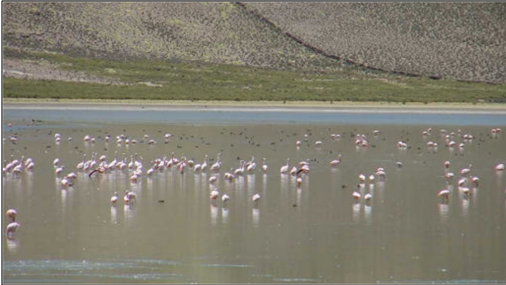
Flamingos and Coots at Laguna de los Pozuelos

Chilean Flamingo. A late afternoon and early evening birding at Yala Provincial Reserve yielded the top bird of the trip, garnering seven votes – a beautiful, singing, quivering, close, male Lyre-tailed Nightjar.