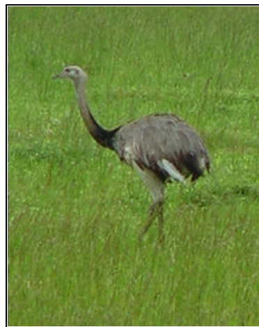
Greater Rhea, Male

Day 4, Monday 28 October A long drive (with a nice stop for five Greater Rheas) brought us to the Area de Relleno Sanitario de San Francisco in the afternoon. (Doesn't that sound nicer than land fill?) Got a White-winged Black-Tyrant but missed the key bird - Dinelli's Doradito. Night in San Francisco.